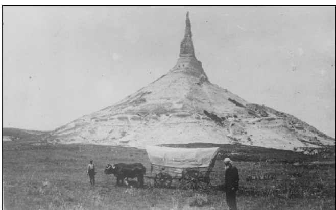
Ezra Meeker and his ox team at Chimney Rock, July 1906.

One hundred ten years ago in July 1906, Ezra Meeker stopped at Chimney Rock near Bayard, Nebraska, on his retracement, from west to east, of his 1852 journey along the Oregon Trail.