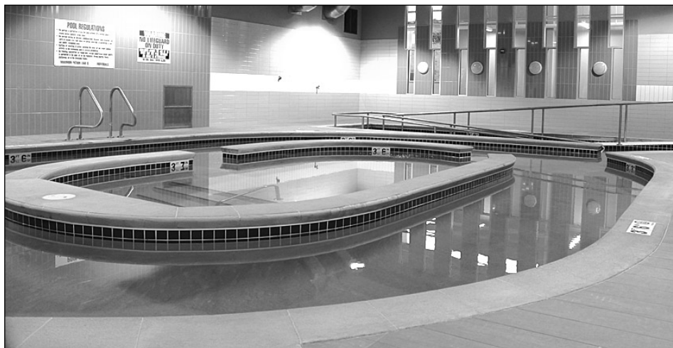
Two aquatic exercises are on the schedule for the Korff Fitness and Wellness Center's one year anniversary Dec. 21. Participants are invited to learn how low impact exercises in the water are designed and are beneficial for all fitness levels.

Because the gift is endowed, the principal remains intact. Only a portion of investment earnings is used for grants. The endowment continues to grow in order it may give back for generations of community improvements.