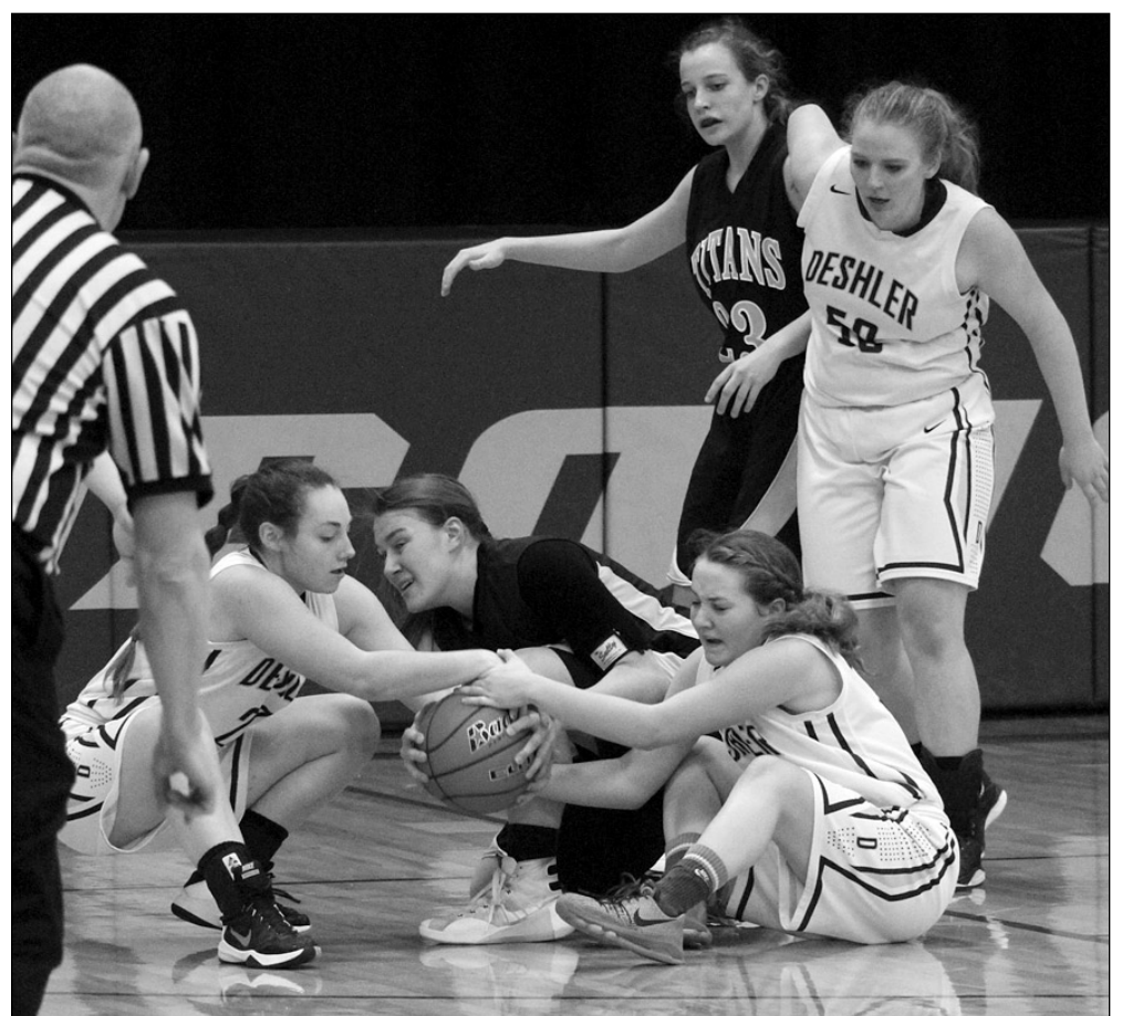
The Lady Dragons battled the Lady Titans in a physical game Jan. 7. Free throw shooting contributed heavily to the Dragon win.