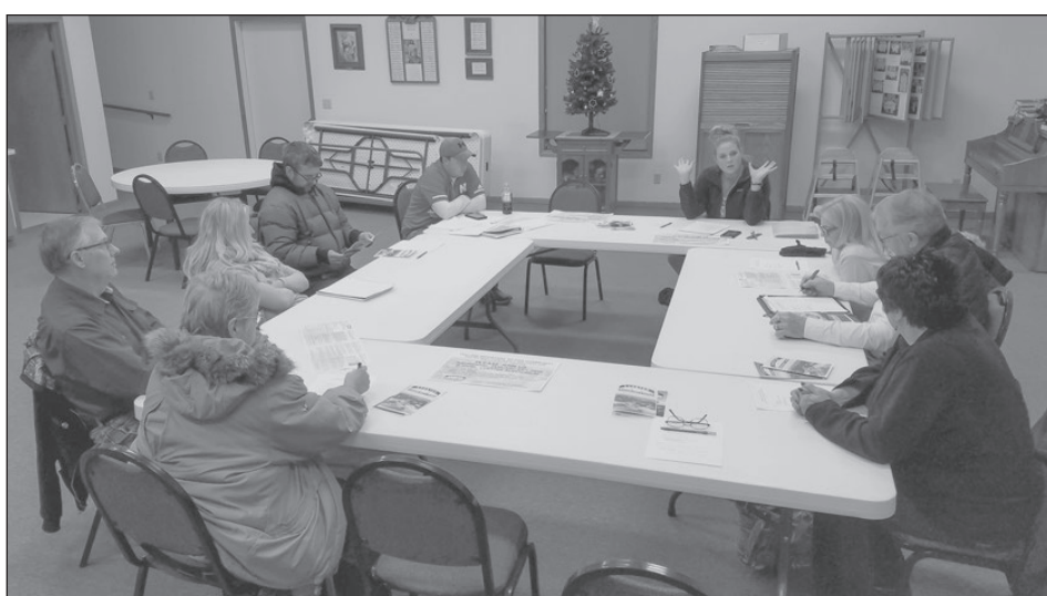
JR Photo/Art Whitton