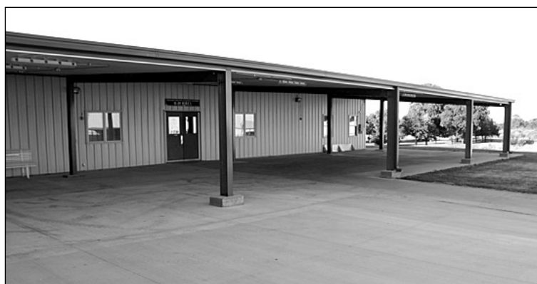
The Brenda Kerns family helped make this 26 by 92-foot awning at the 4-H building on the fairgrounds possible.

The horse barn received a new coat of paint by 4-H group, Big Green. New cement will be poured, along with new lighting installed and lighting repairs.