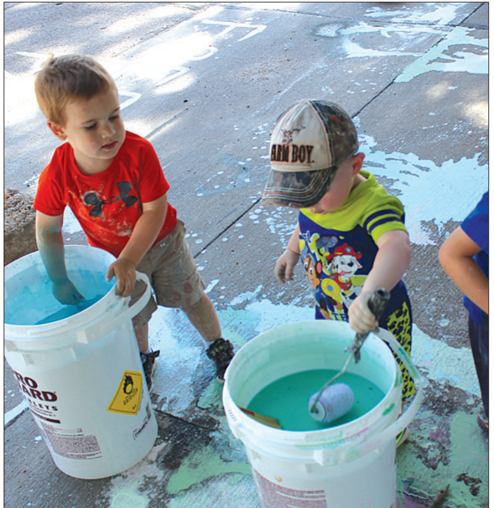
Free activities for children included a liquid chalk paint-fest. The mixture, made from cornstarch, water and food coloring, kept budding artists busy.