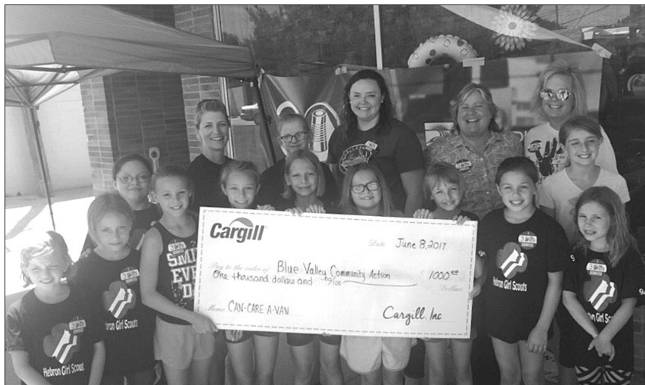
Cargill took the Blue Valley collection count up with a $1,000 donation. Girl Scout Troop 941 held the check up in between carrying boxes of food to the back and filling pantry shelves.