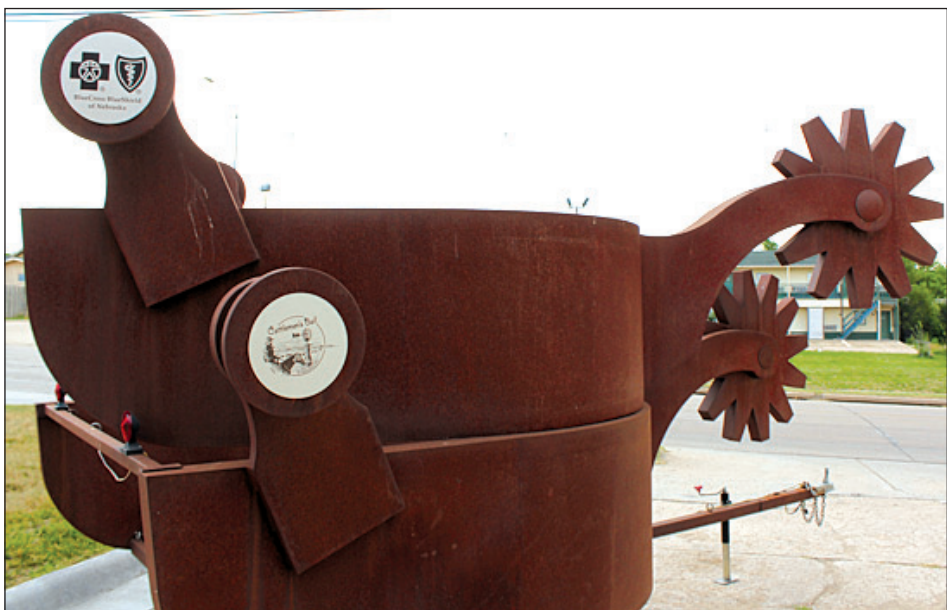
The traveling spurs of the Cattlemen's Ball sit in front of Hergott Enterprises and will make their way around the area until the 2018 ball.

and Pamela Buffet Cancer Center in Omaha, a 10-story, 98-laboratory research tower with an eight-story, 108-bed inpatient treatment center and multidisciplinary outpatient center.