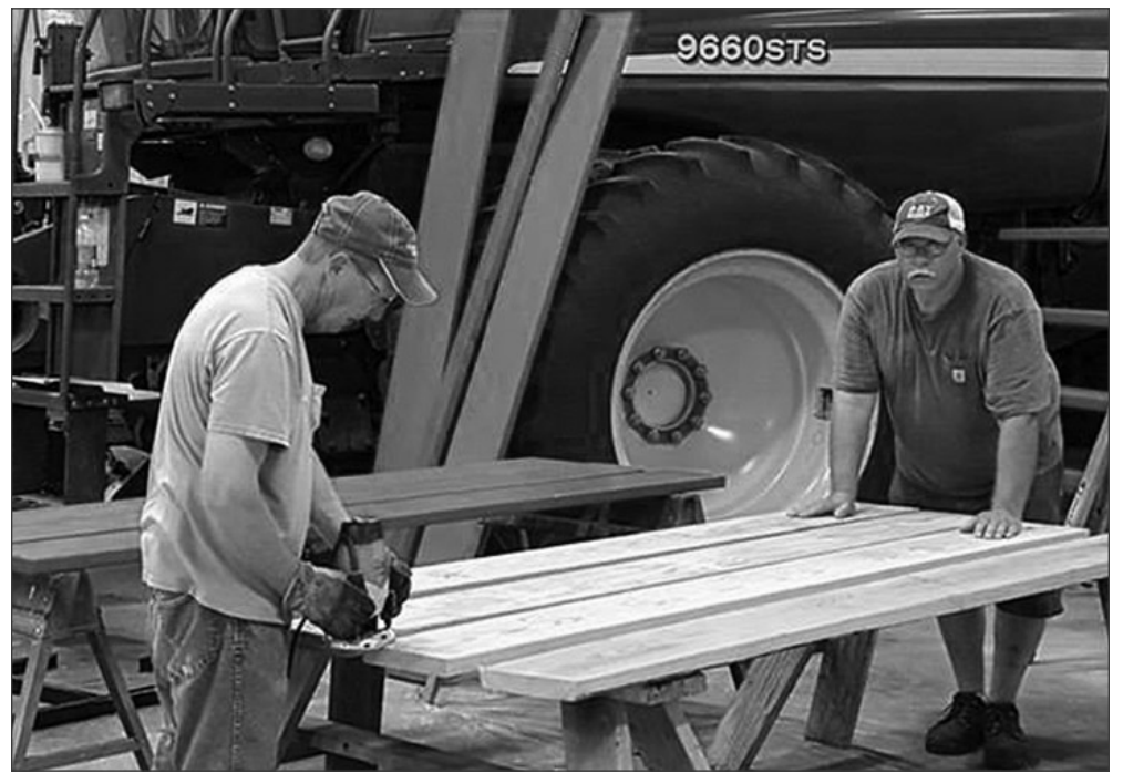
JR Photo/Art Whitton

The new building that will house the Chester ambulance is nearing completion.