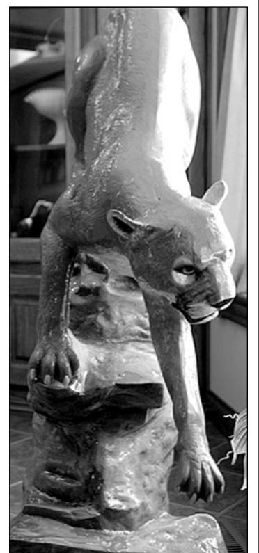
A cougar will be moved to Nebraska City.

it. Replicas of the swing could adorn Lincoln Avenue. Painted with imagination, the replicas could be two seats and promote the Cattleman's Ball as well.