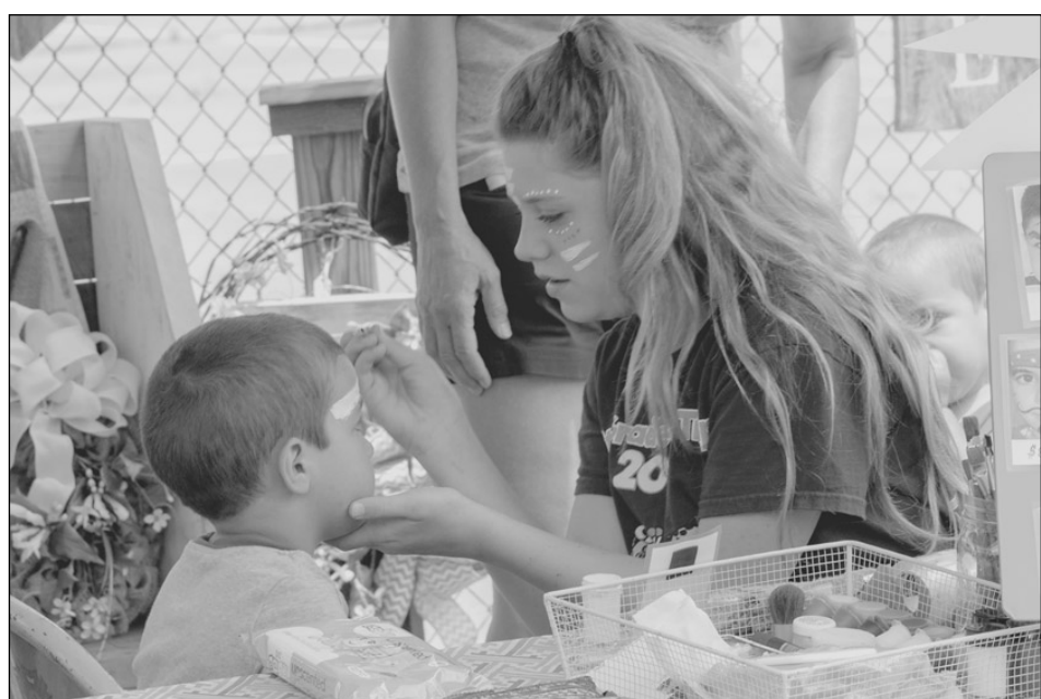
JR Photo/Art Whitton

While the art fair was running, a talent show was held in the Chester Auditorium. A good sized crowd was treated to some excellent singing and even participated in an impromptu dance of the "Hokey-Pokey." The talent show participants then took their acts to the main concert stage and began the evenings festivities. A pulled pork dinner cooked by Foote's Cafe kept the crowd well fed as they gathered for the evening concert which featured three bands. Before the last musical set, a great fireworks display was presented by Kleveland Fireworks and the Chester VFD.