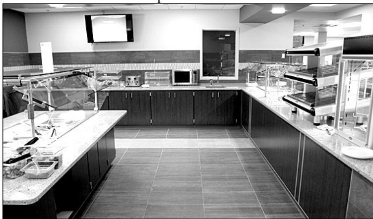
The cafeteria area in the Little Blue Bistro at Thayer County Health Services serves a salad bar during lunch, 11:30 a.m. to 1 p.m.