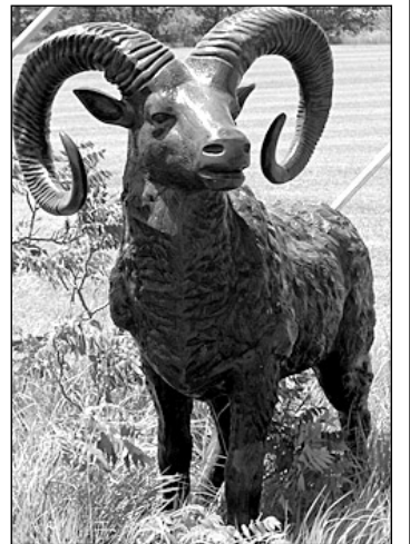
Bighorn sheep on 13th Street and Dove Road.

"You have to do something in order to lure people to town. You have to be a little different than the rest," Elting said in his house just east of the first sculpture he brought to Hebron — a buffalo made of sturdy aluminum.