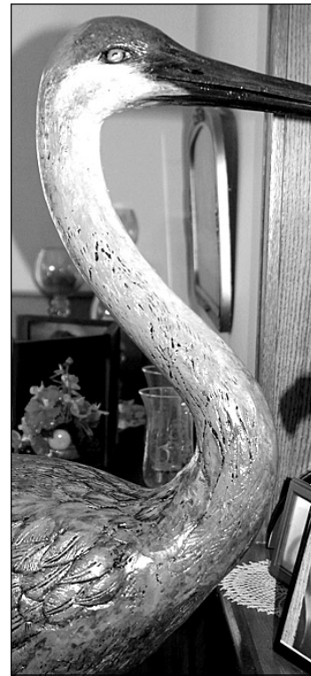
Nebraska Sandhill Crane.

"It isn't bronze, none of them are bronze. If they were, no one could afford them," Elting said. "I fell in love with the buffalo. People come across from the motel to take pictures."