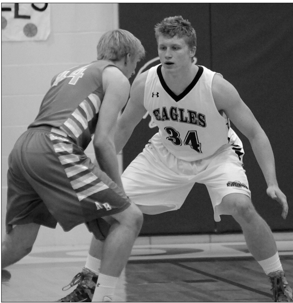
JR state tournament