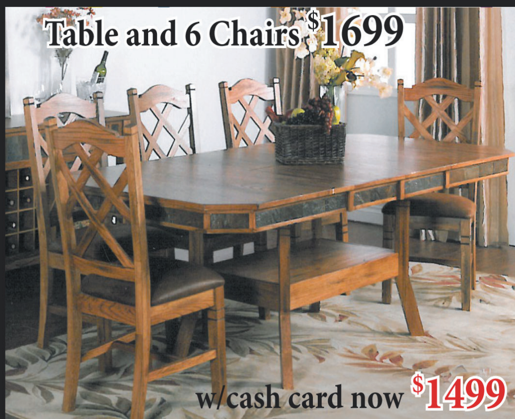
Table and 6 Chairs $1699

Plus! 12 MONTHS SPECIAL FINANCING Available!