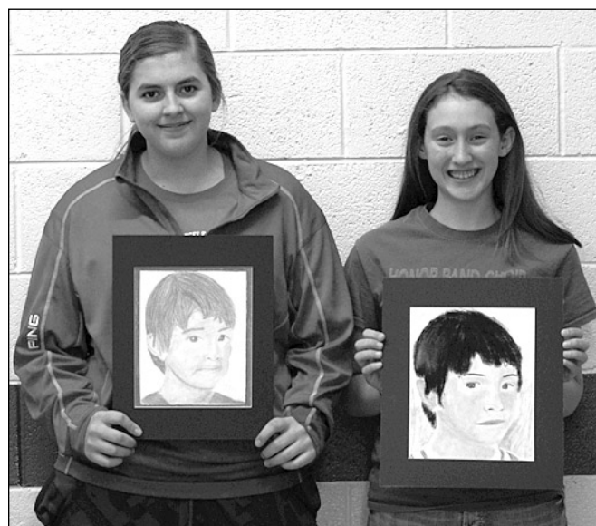
Shickley photos courtesy of Gina Kamler

The purpose of the Miss Tourism Pageant is to emphasize the efforts of girls and women across the nation. The contestants want to make a difference in their communities, promote tourism in their states and truly wish to be community role models. Abbi was chosen to represent Nebraska because she excelled in the pageant's requirements.