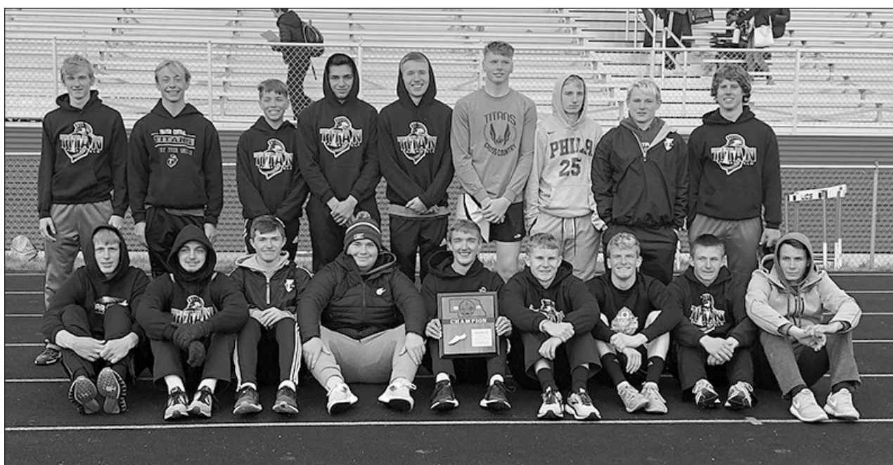
The Thayer Central Boys track and field team won the C7 district title at Sandy Creek May 9. The boys had 100 points. Second place was Doniphan Trumbull with 74 points. Coming in third was Sutton with 62 points.