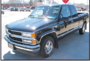
1997 Used Chevrolet C/K 1500