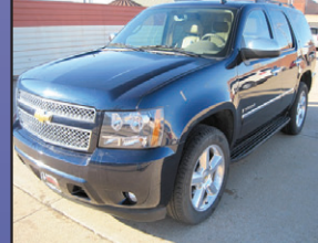
2009 Used Chevrolet Tahoe LTZ