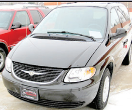
2004 Used Chrysler Town & Country LX