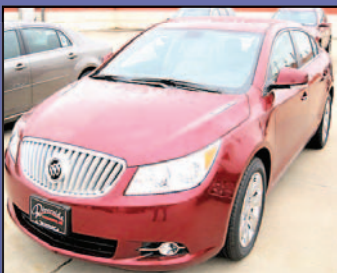
2011 Buick LaCrosse CXL 4dr Sdn CXL FWD