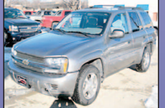
2008 Used Chevrolet TrailBlazer Fleet w/2FL