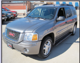
2005 Used GMC Envoy XL SLE