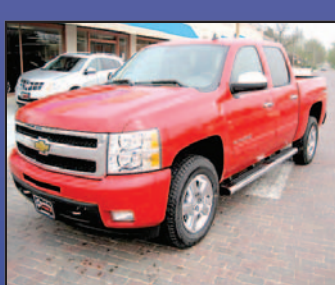
2011 New Chevrolet Silverado 1500 LTZ