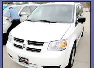
2008 Used Dodge Grand Caravan SE