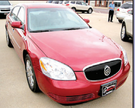
2007 Used Buick Lucerne V6 CXL