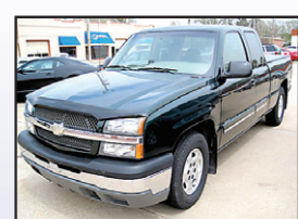
2003 Used Chevrolet Silverado 1500 LS