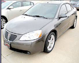
2007 Used Pontiac G6 G6