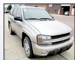
2003 Used Chevrolet TrailBlazer LT