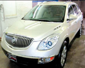
2008 Used Buick Enclave CXL