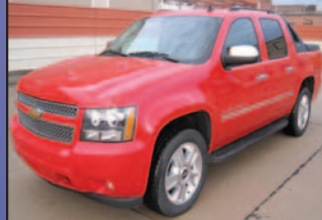
2009 Used Chevrolet Avalanche LTZ