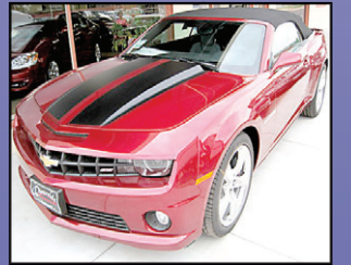
2011 Chevrolet Camaro 2SS 2dr Conv 2SS