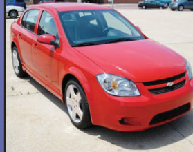
2009 Used Chevrolet Cobalt LS