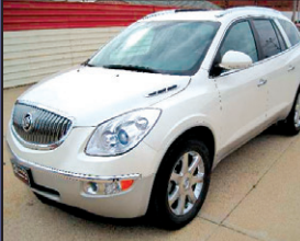
2009 Used Buick Enclave CXL