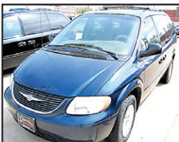
2002 Used Chrysler Town & Country LX