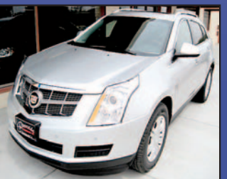
2011 New Cadillac SRX Luxury Collection