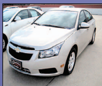
2011 Chevrolet Cruze LT w/2LT 4dr Sdn LT w/2LT