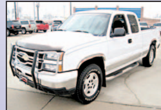
2006 Used Chevrolet Silverado 1500 LT1