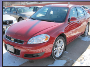
2008 Used Chevrolet Impala LTZ