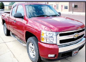
2007 Used Chevrolet Silverado 1500 LT w/2LT