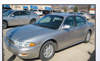
2004 Used Buick LeSabre Custom