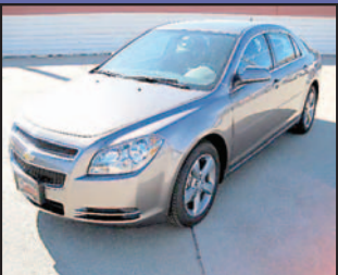
2011 New Chevrolet Malibu LT w/1LT