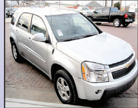
2006 Used Chevrolet Equinox LT