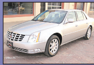
2008 Used Cadillac DTS w/1SC