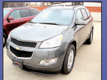
2011 New Chevrolet Traverse LT w/1LT