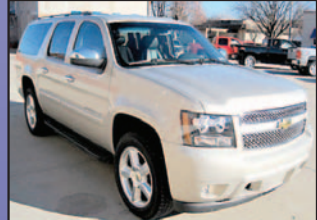
2008 Used Chevrolet Suburban LTZ