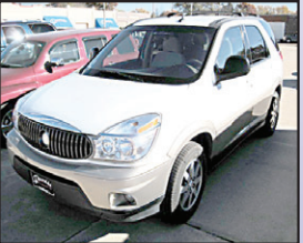
2004 Used Buick Rendezvous