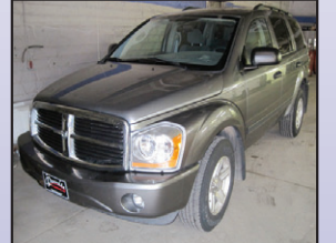
2006 Used Dodge Durango SLT