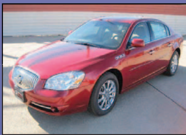
2011 New Buick Lucerne CXL Premium