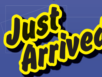
2011 Chevrolet 2500HD Regular Cab