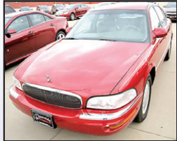
1998 Used Buick Park Avenue