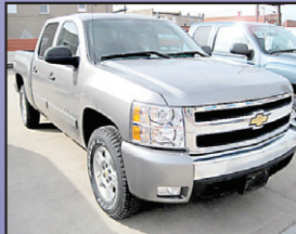
2007 Used Chevrolet Silverado 1500 2LT