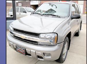
2008 Used Chevrolet TrailBlazer LT w/1LT