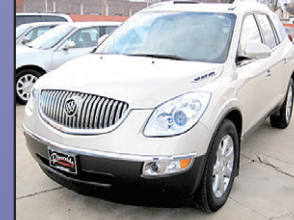
2008 Used Buick Enclave CXL