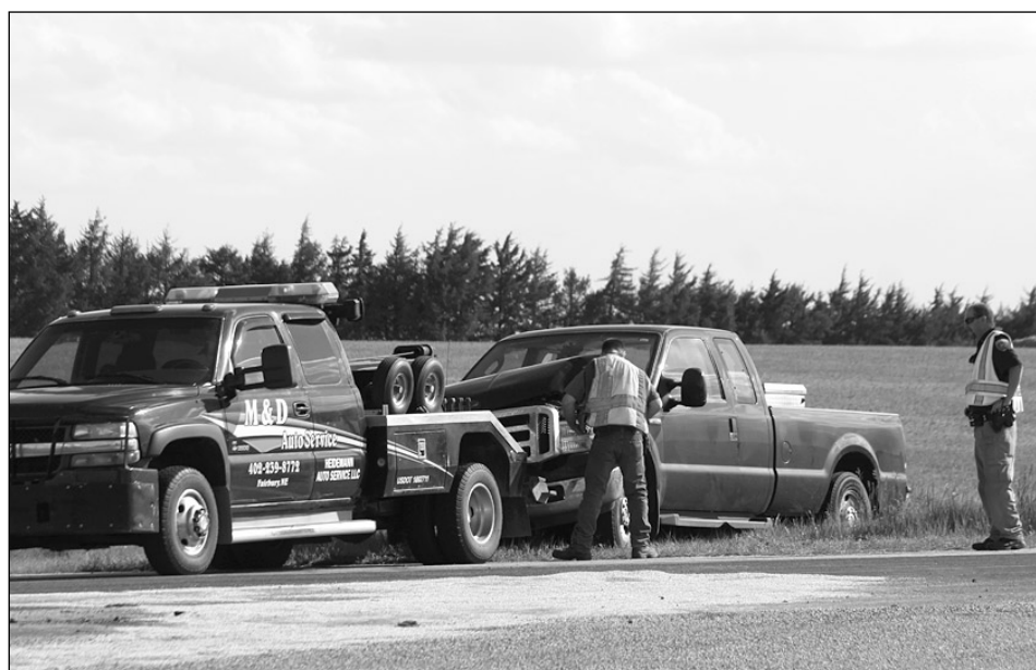
Thayer County deputies and Nebraska State Patrol worked a two-vehicle accident on Road 6100 and Highway 136 May 23. Two people were taken to Thayer County Health Services.