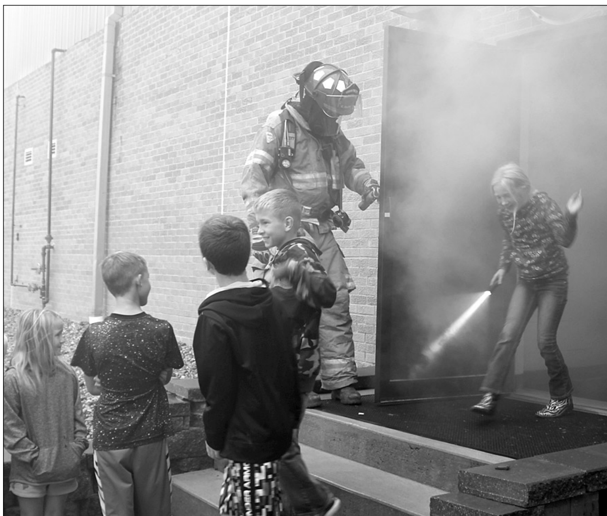
A Hebron Volunteer Fire Fighter holds the door Monday as students emerge from a smoke-filled locker room at Thayer Central Elementary School. The fire fighters were at the school to teach fire safety during Fire Prevention Week, Oct. 9-15.

The Journal-Register's salute to Fire Prevention Week and Thayer County's volunteer fire departments may be found on pages 8-9.