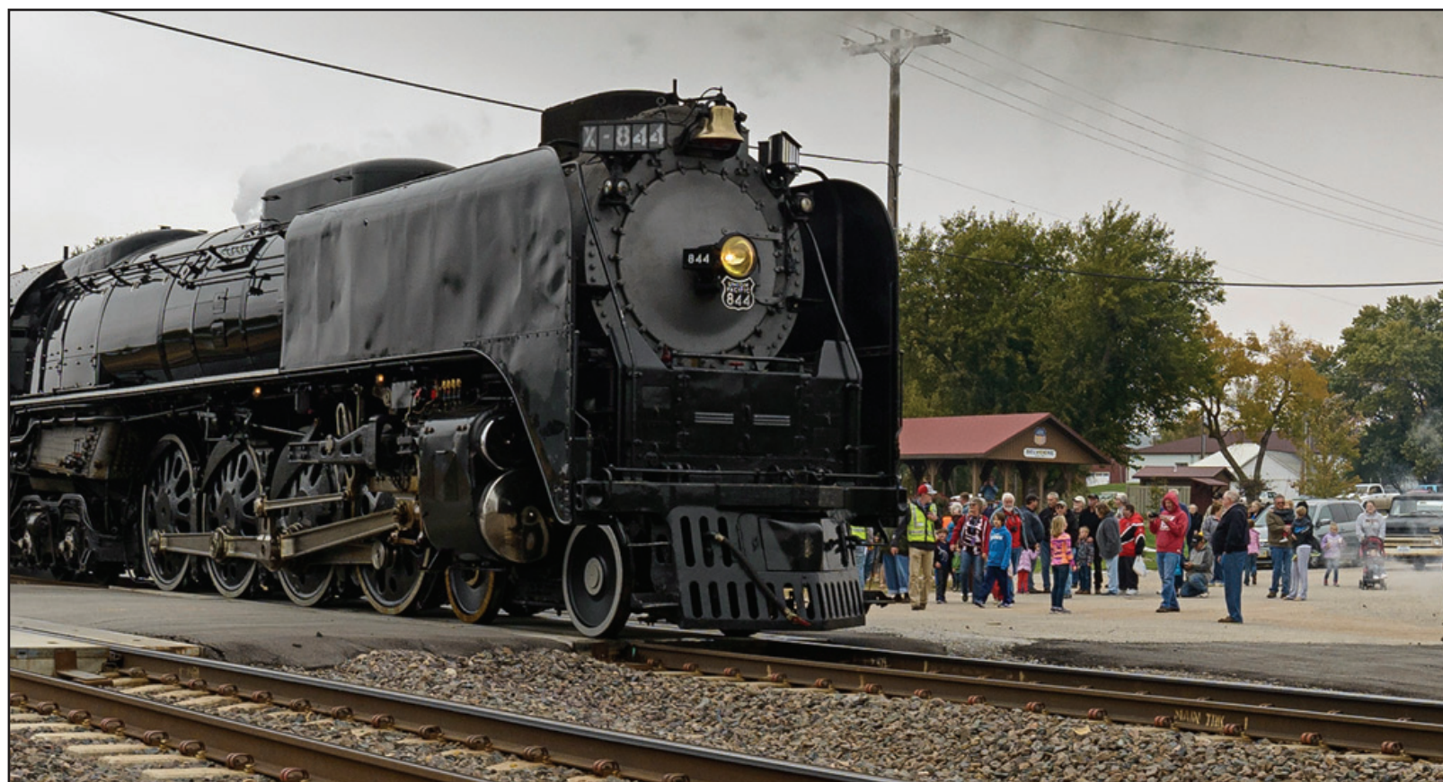
JR Photo/Art Whittom