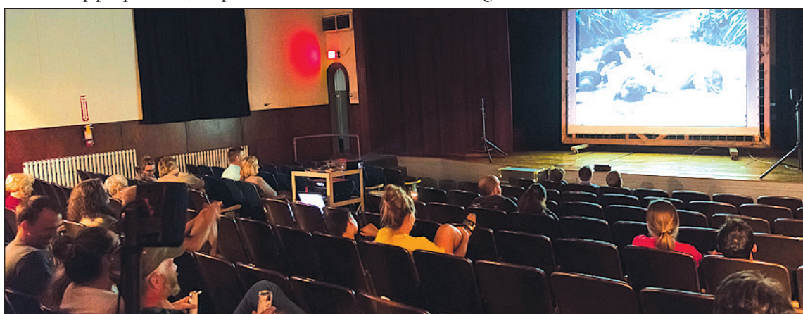
The Chester Community Club sponsored a Theater in the Park event. The movie was viewed in the Chester Auditorium because of storms.

"It's amazing what that town pulls off," he said. Brownville features a concert series, walking trails, tourist stops, flea markets, and it converts old buildings to museums.