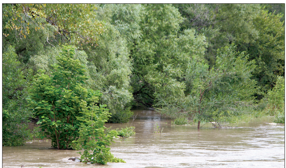
The Little Blue River continued to rise Monday as the National Weather Service issued a flash flood watch, hazardous weather outlook and flood warning. The rain was expected to fall until Saturday.

Big times a coming this weekend. Of course the Colorado-Husker game and Carleton's Milo Day where you can eat all the Milo pancakes that you want. Then in Belvidere that night, you can attend the outside street dance, the Farmers' Ball, in front of Toad's. Well known bands will be playing starting at 7 p.m. The proceeds will go toward the restoration of Toad's Place. It is so important to keep this place of business in our town. Support it if you can. It will be a fun time! Belvidere will thank you. Talk to you in a week, that is the good Lord willing and the creeks don't rise!