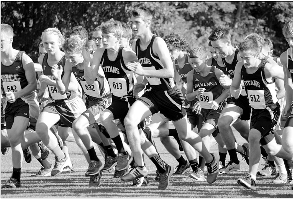
The Thayer Central Cross Country took off at their first meet of the season in Superior Sept. 1. Results were not available by press time.